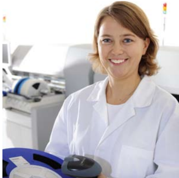
The unique ID used for assigning components to feeders.

To make errors is human, and expensive. Conventional, manual access storage systems carry a high risk for mix-ups. Depending on when mistakes are noticed, a great deal of damage may already have occurred. At best, time for set-ups increases and valuable production time decreases. In worst-case scenarios, entire production batches are beyond repair. In addition, searching