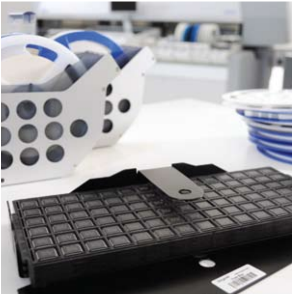
Tray box for up to 3 JEDEC trays.